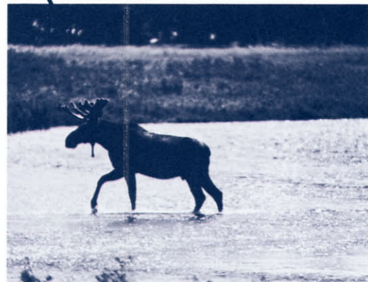
Symposium III: September 11-12, 1984 Water for Human Consumption and Symposium IV: September 13-14, 1984 New and Innovative Concepts for Meeting Our Water Needs