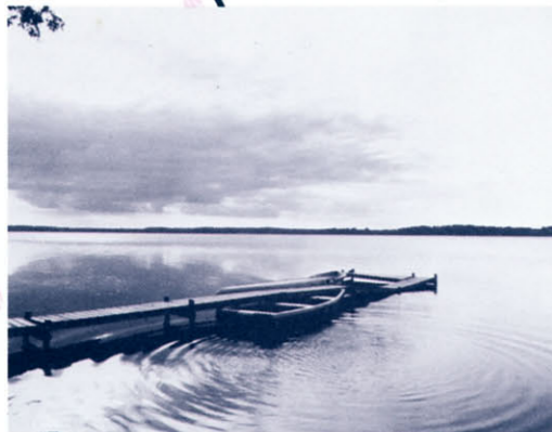
Symposium I: July 10-11, 1984 Rivers and River Management and Symposium II: July 12-13, 1984 Water to Sustain Agriculture and Industry